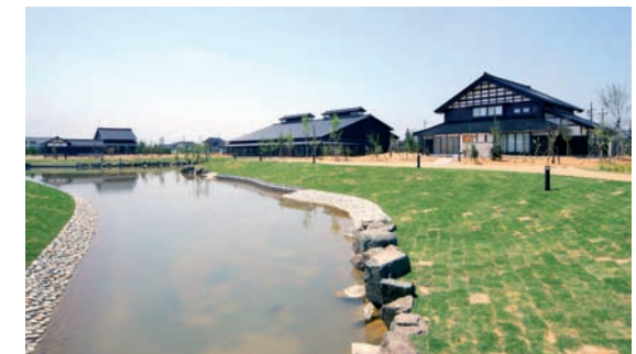
The view of Tonami Sankyo Village Museum from the recreational pond

The landscape of Sankyo in the plains of Tonami is noted to be one of the most well known Japanese rice crops villages in Japan. Tonami Sankyo Village Museum was established with the purpose to upkeep the landscape and to promote the dispersal of the local culture throughout the country. Tonami Plains Country Museum serves as a base to help stimulate the vibrancy in the district. The museum comprises of the Information Center, Heritage Center and the Community Center, where one can capture information and experience the traditional culture of Sankyo.